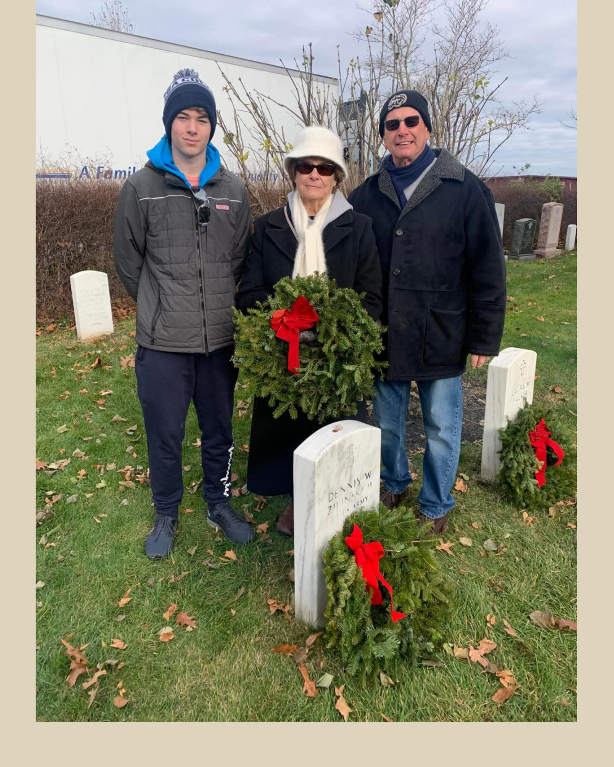
Trees for Troops!