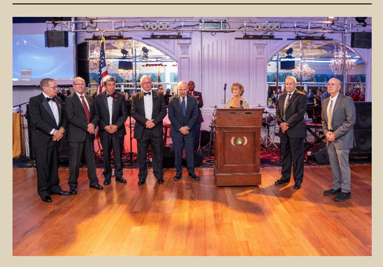
Our 2023 Honorees: Vietnam Veterans

It was an honor to choose the Vietnam Veterans as our 2023 Honorees of the Year, as we celebrate the 50th Anniversary of the date the last combat troops left South Vietnam.